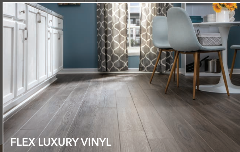
FLEX LUXURY VINYL

Resilient fiberglass construction delivers superior performance, while waterproofing keeps spills on the surface, and a seamless finish makes cleaning a breeze.