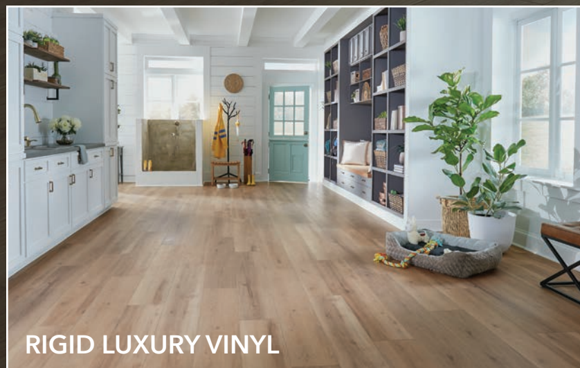
RIGID LUXURY VINYL

Affordable, waterproof plank flooring for spaces with high traffic and rolling loads. A great solution for easy maintenance and repair.